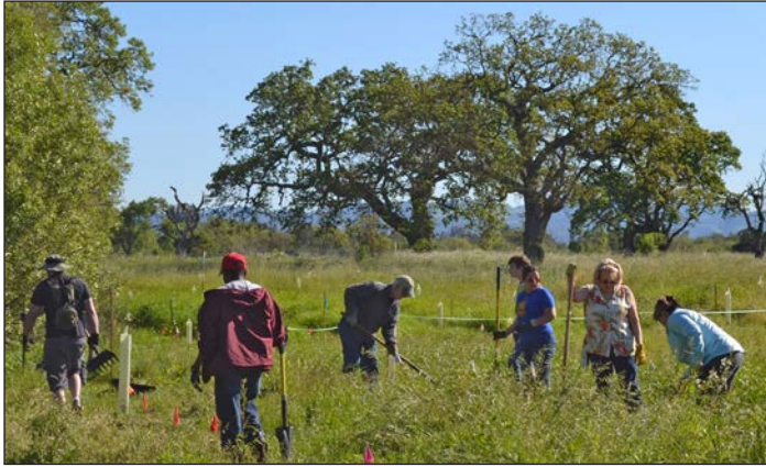
This season, our team of volunteers helped break ground on a new restoration project along Gravenstein Creek on Brown Farm in Santa Rosa!