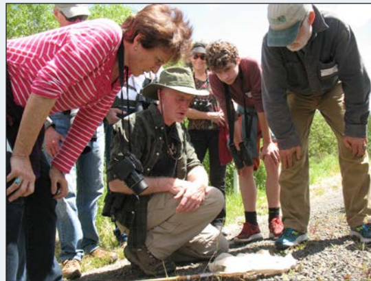
Exploring together along the Southern Laguna Discovery Trail.

our land partners like the Cities of Santa Rosa & Sebastopol, the Ag and Open Space District, and our non-profit partners LandPaths, Bird Rescue Center and many others have countless benefits as they are pathways to the Laguna and the Laguna Foundation for all. We have a public education program for you, for the Laguna now and for the future. So, by signing up and participating, not only are you financially supporting the program, you are voting