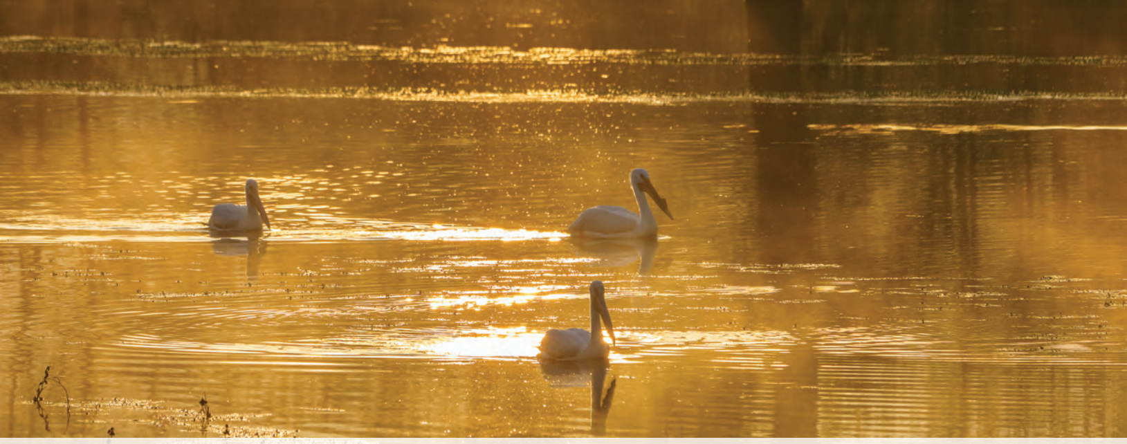
Improving water quality and enhancing wildlife habitat through