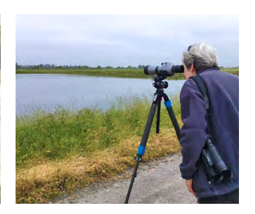
Sharing the wonders of the Laguna at our