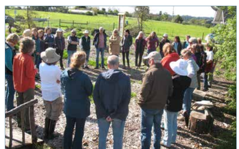
Learning Laguna Docents at Laguna Foundation's Spring Back-to-School event.

These friendly, responsible, knowledgeable volunteers are essential to the smooth functioning of all our public education programs. Fourteen people stepped up this year to participate in our 32-hour Laguna Guides training course. They graduated in June and got to work right away, increasing the Guides circle to 35 active volunteers. We venerate and thank the Laguna Guides for contributing more than 650 hours of volunteer service this year.